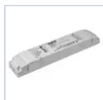
19398 INV UNIV AT RM 5W 20-240V