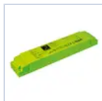
19367 INV P&L LED SE/SA 1H 60- 180V