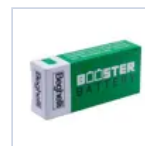
RA13 BOOSTER BAT LiFe 6.4V 1.5Ah