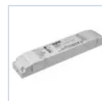
19399 INV UNIV CT 5W 20-240V