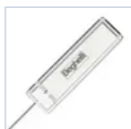
15037 MODULO LGFM