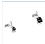
201954000 KIT 2 GANCI SOSPEN ST EASY LED