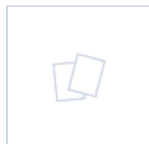
15079 MODULO LG SLIM